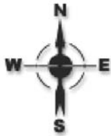
Sketch Floor Plan

Water Pressure _____ No. of Bathrooms _____